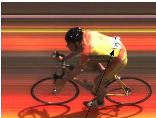
Bad number example cannot be read