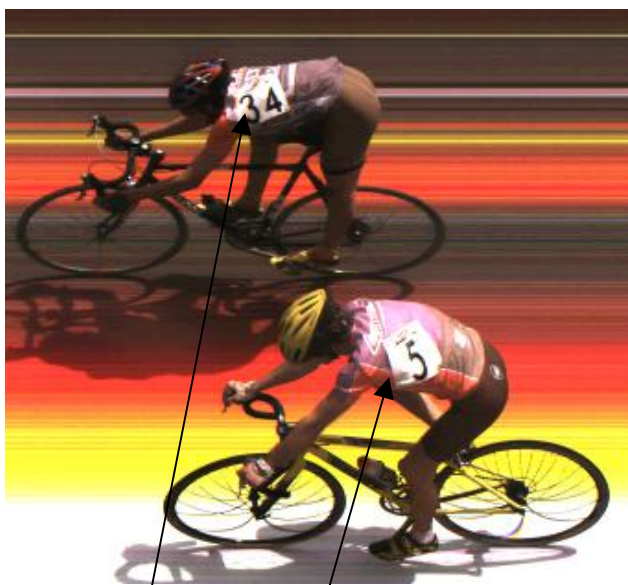
Good number examples easily read